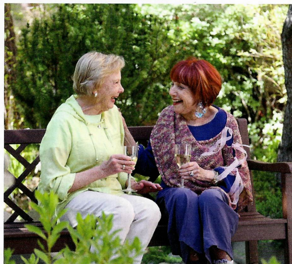
Residents enjoy a plethora of social activities on and off campus.

On-site lectures, art exhibits, concerts, computer and language classes are available. Also on site is a fitness center, pool and spa, woodshop, arts & crafts room, library, and game room. Meditation, yoga, and Tai Chi classes are offered, as