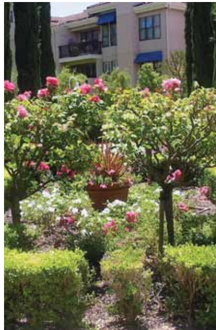
The Rose Garden in full bloom.

“The goal of our committee is to enhance, protect and maintain the