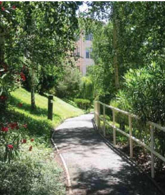
Walkways meander between the buildings and throughout the 50+-acre property at The Forum.

Hiking trails, horseback riding, tennis courts and Deer Hollow Farm are just a short walk away at the adjacent Rancho San Antonio Open Space Preserve. The Forum also features meandering pathways