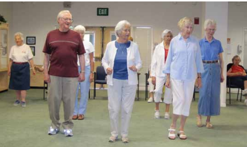
Line dancing is a popular class at The Forum.